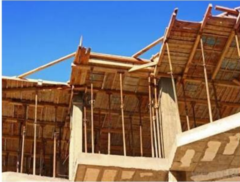
Fig no.1 Timber Formwork

B. Plywood: The use of plywood in concrete forming for form in front of has improved the quality of finished concrete. The relatively large sheets of plywood have cheap the cost of building and at the same time have provided smooth surfaces that reduces cost of finishing of concrete surfaces. Plywood is a manufactured wood product consisting a number of veneer sheets, or pile. Type of plywood can be grouped as exterior and interior. For formwork the exterior plywood is used. Bonding agent used to bond the piles in manufacturing of exterior plywood is watertight and gives maximum number of reuses.