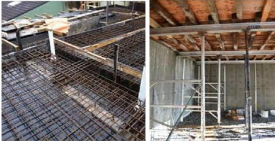
Fig no.6 Slab Formwork