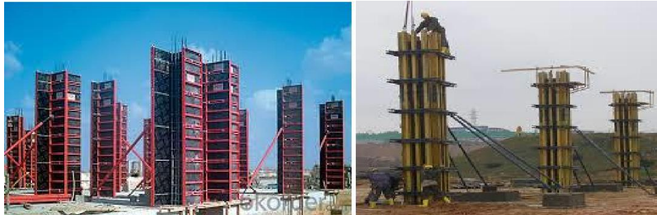
Fig no.4 Column Formwork

Column formwork is made usually with either timber or metal panels. The principle is to create an enclosed box with frames at the exact size of the column and fix it tightly on the kicker left from base or at the last stage of column concreting. The box is held in position by steel column clamps or bolted yokes and supported by timber studs or props.