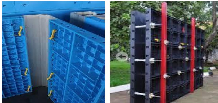
Fig no.3 Plastic Formwork

They have impermeable surfaces that usually create a smooth finish to the concrete. Plastic formwork could be reinforced or unreinforced. Plastic is reinforced by glass fibers. Reinforced plastics are specially produced for a specific formwork type. Un-reinforced plastics are produced in sheet form with smooth or textured surfaces. Plastic formwork is lighter but less durable than metal formwork.