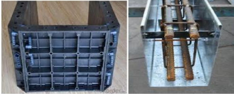
Fig no.2 Metal Formwork

The initial cost of metal formwork is more than timber formwork but the number of reuses of metal formwork is higher than that of timber. In long run metal formwork can be economical. In heavy construction works metal formwork may require a lifting mechanism to handle the formwork panels or props. Steel sheet formwork has the problem of rusting also. To avoid rusting, in every use the surfaces should be oiled with an appropriate releasing agent. Metal formwork usage, the metal sheets are prepared as panels of standard sizes. This brings the difficulties of erecting irregular dimensions of formwork. Steel or aluminum or magnesium is the most widely used metals.