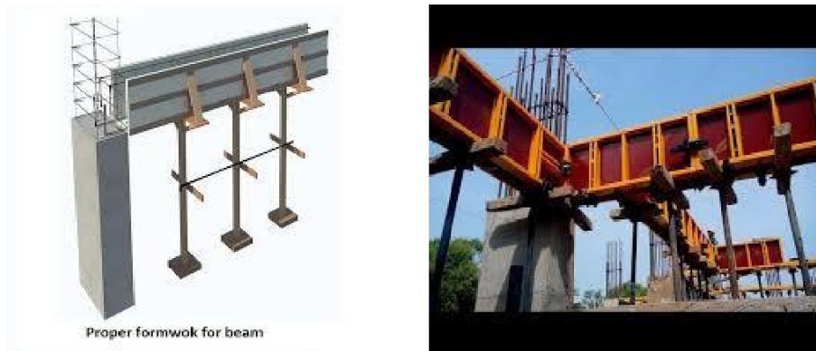
Fig no.5 Beam Formwork

Beam formwork consists of open through section and because it is not closed at the top requires more supporting frame work to restrain the sides. The supports need to be maintained to the soffit and also provide lateral support to the sides. In timber this is done by the use of a head tree across the top of a vertical member. Metal panels are used with corner pieces, but timber head trees are needed for vertical support.